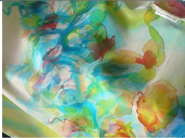
Dance under the Sea

Other designs select from my website, indicate name here: